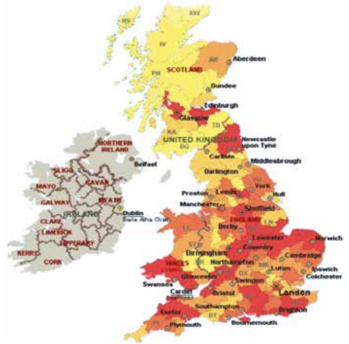
Revenue by region

Faststats Excelsior allows you to incorporate data from external sources with Faststats data in a single report. For example, additional business information from budgets, sales or operations can all be integrated with marketing data to create truly powerful and all-encompassing reports.